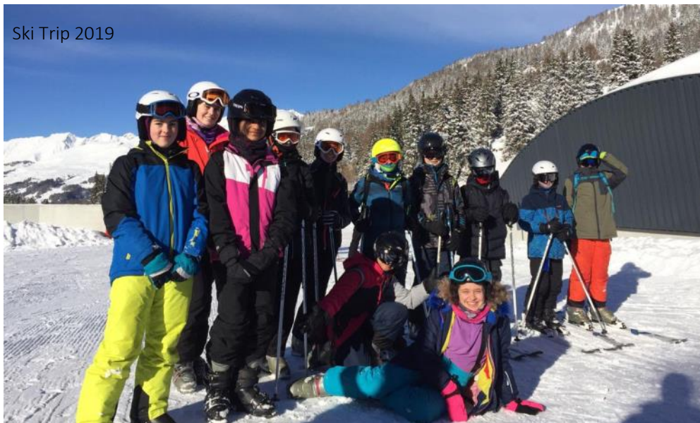
Ski Trip 2019

The centre provides bespoke outdoor activity trips, specially designed to help young people develop a good sense of adventure and discovery. This very much feeds into the Manor ethos of enrichment as a way of developing the student as a