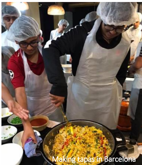
Making tapas in Barcelona

Opportunities include students trying their hand at making (and eating) tapas, visiting the iconic Olympic and Camp Nou stadiums, marvelling at the spectacular work of the famed architect Gaudí and visited a Spanish school to meet their pen friends in person. The trip culminates with a free day enjoying Water World at Lloret de Mar.