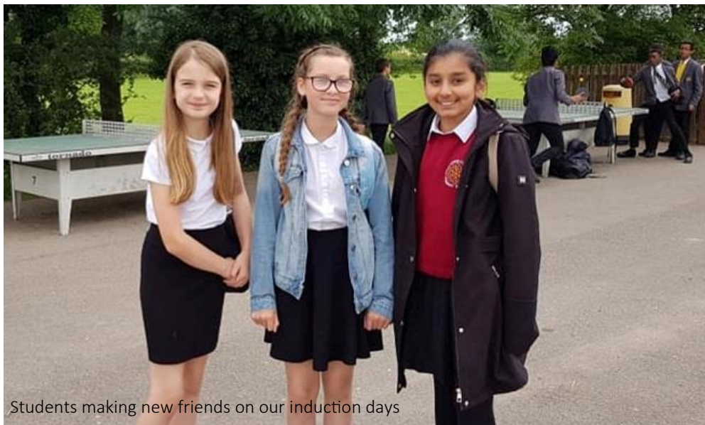
Students making new friends on our induction days

All applications for places at Manor High School must be made through the Local Authority where you live: