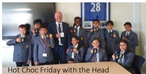
Hot Choc Friday with the Head