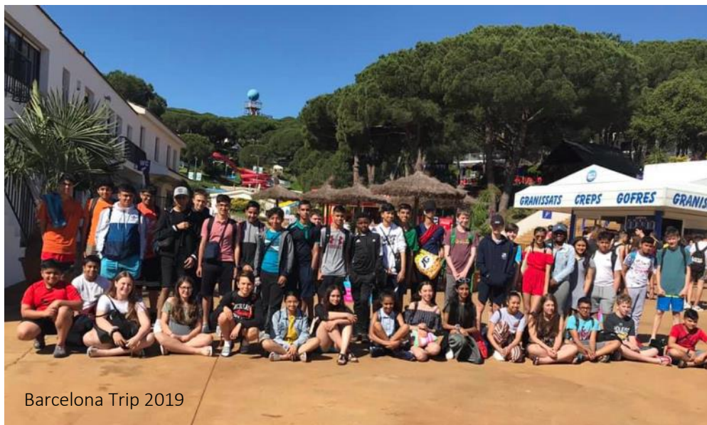
Barcelona Trip 2019

At Manor High we like to immerse our students in their subjects, which means we have many great opportunities to explore both near and far on our extra-curricular trips.