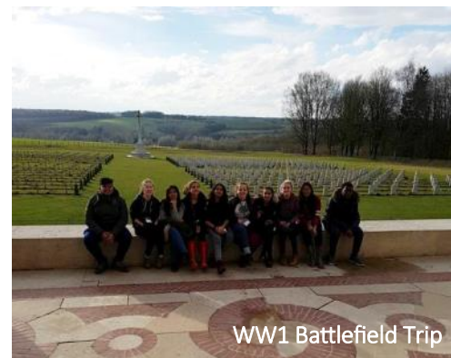
WW1 Battlefield Trip

To commemorate the anniversary of the end of WW1, Manor High history students were invited to visit the battlefields of Ypres and the Somme.