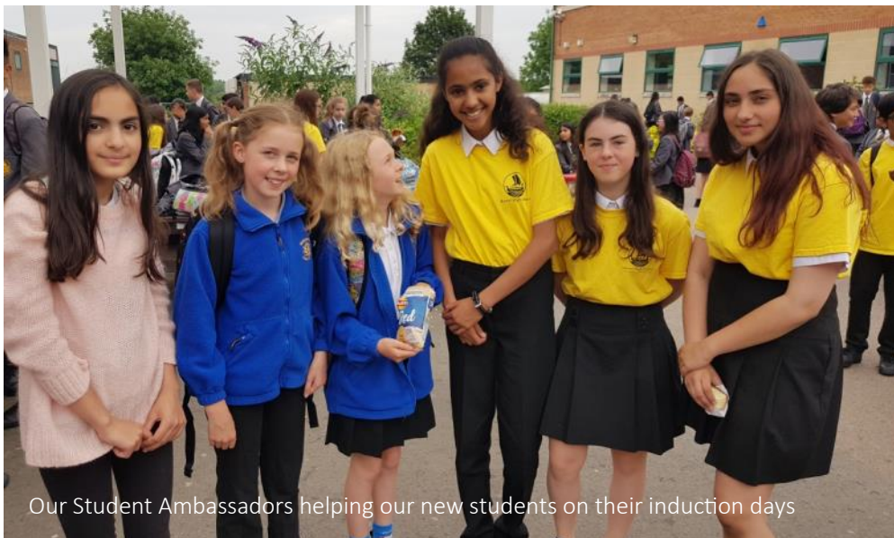
Our Student Ambassadors helping our new students on their induction days

Each year (except for 2020, thanks to Coronavirus) we welcome our new cohort into school over three days during the last week of the summer term.