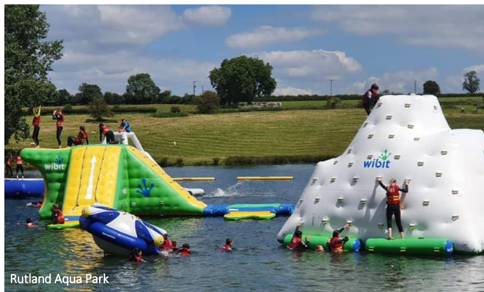
Rutland Aqua Park

The central theme of the day was resilience. Some of the students were