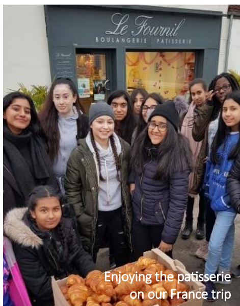
Enjoying the patisserie on our France trip

The students visited a Boulangerie Patisserie, to learn about how they bake bread using age-old methods as well as trying their hand at making croissants.