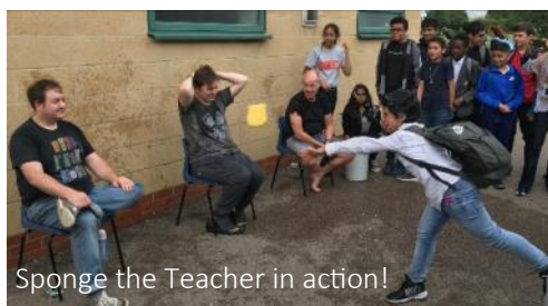
Sponge the Teacher in action!

Our house system gives our students a sense of belonging within the school and ensures that there is cohesion and peer support between year groups.